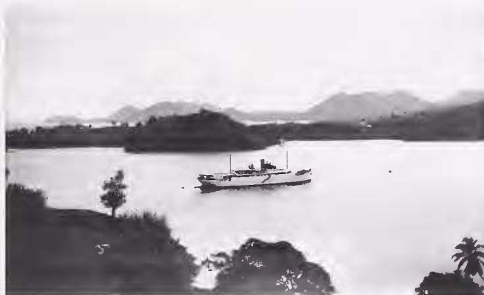
Fig. 3: The Utowana anchored off Castries, St. Lucia (Ernst MAYR Library of the Museum of Comparative Zoology, Harvard University. © President and Fellows of Harvard College).

During his lifetime, ARMOUR spent considerable time cruising on a series of boats, especially in European waters. Prior to World War I, he used a schooner-rigged vessel for archaeological research in North Africa. The yacht (Fig. 3) that carried BARBOUR on the West Indian